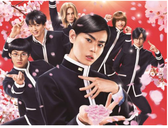
©2017 FUJI TELEVISION NETWORK/SHUEISHA/TOHO ©USAMARU FURUYA/SHUEISYA Ali Rights